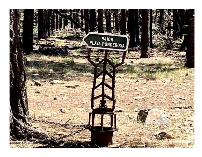
Turn left on 9410R when you see this sign. Follow the road to Playa Ponderosa's Main Gate. You have arrived!