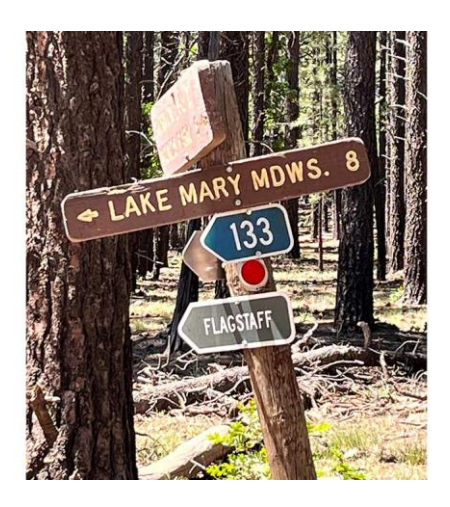
Turn left on FS133 when you see this obscure sign. Drive 0.8 miles to 9410R (Point 6).